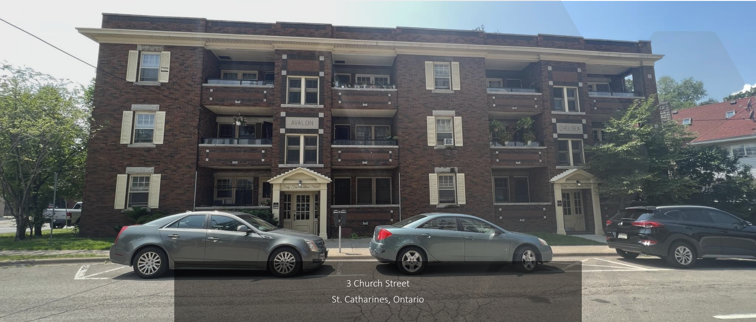
3 Church Street St. Catharines, Ontario