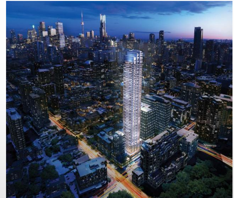
Rosedale on Bloor