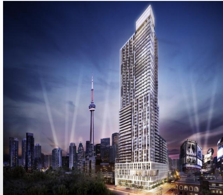
Dundas Square Gardens