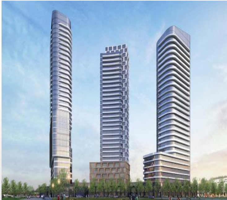
3450 Dufferin Street